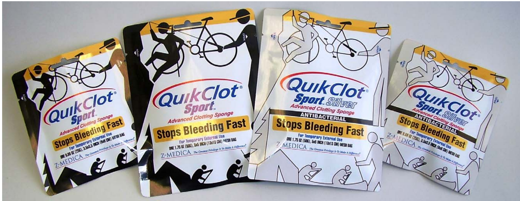
25 or 50 Gram Bags